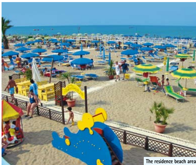
The residence beach area