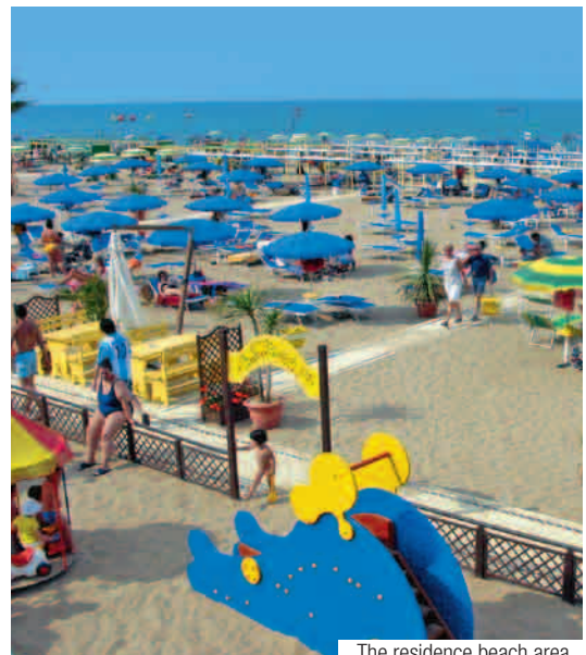
The residence beach area

Rent 21 Pay 16: if you book a holiday of 21 days to spend in May or September, you will receive a reduction of 5 days from the total amount.