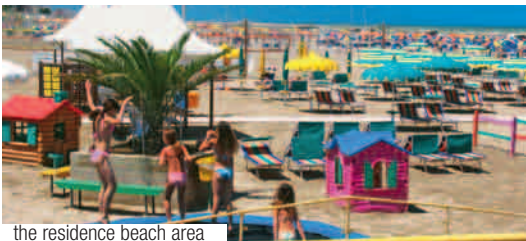
the residence beach area